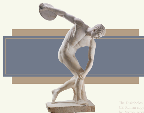
The Diskobolos or Discus Thrower, 2nd century CE. Roman copy of a 450-440 BCE Greek bronze by Myron recovered from Emperor Hadrian's Villa in Tivoli, Italy. (British Museum, London)