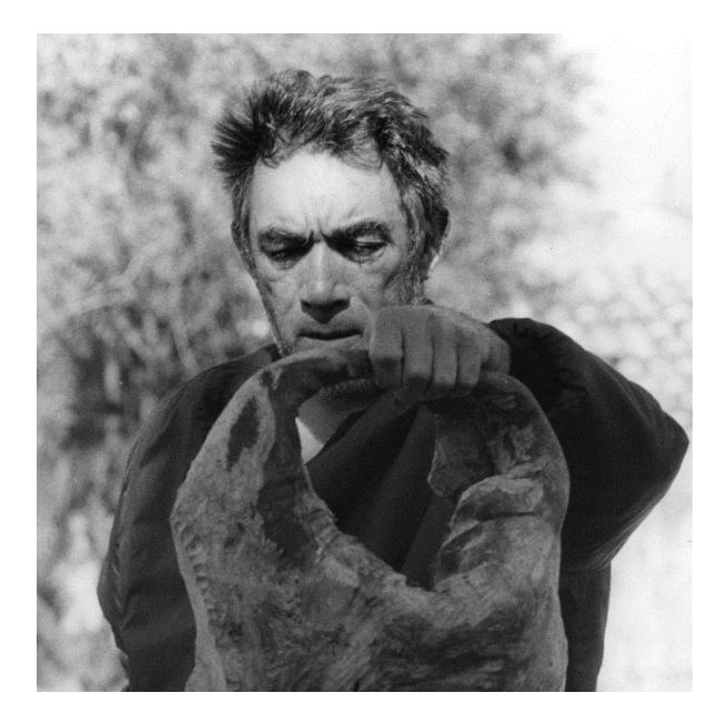
Photo 2: Anthony Quinn painting in Crete while filming Zorba the Greek .